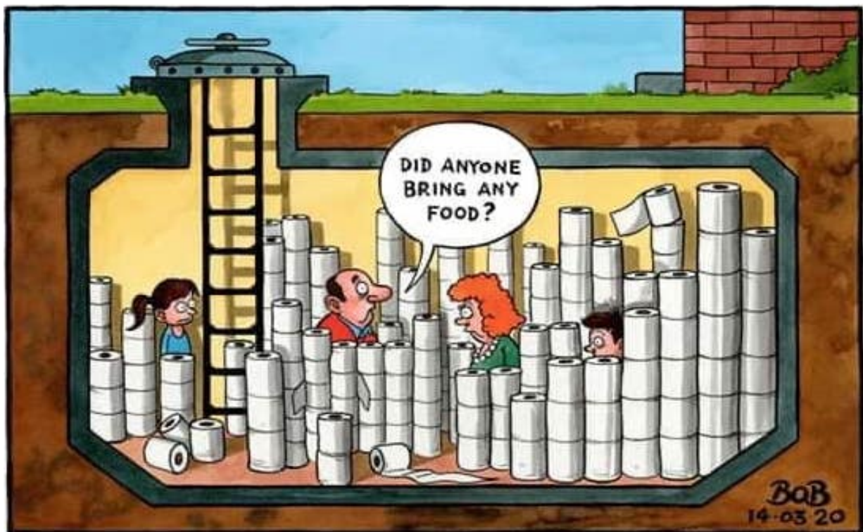
Hope all our members survived lockdown and didn't run out of any of the 'essentials'.